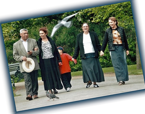
Newham has around 25,000 Roma residents

Did you know that around 25,000 Newham residents are categorized as from the Roma Community?