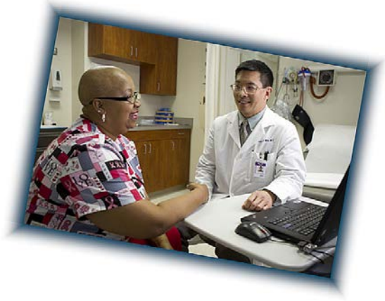
London Cancer wants to take inspiration from you!

Have you been affected by cancer as a patient and/or carer? Would you like to be part of a group that helps to improve healthcare services?