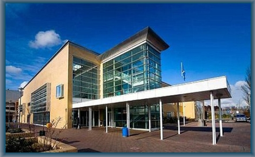
Newham Hospital A&E consistently meets targets

"The special measures regime is designed to aid service improvement by providing help and support where it is most needed. It has worked well with NHS organisations in other parts of the country and I am confident it will work here."