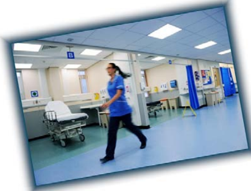
A&E is for medical emergencies

The winter period is one of the busiest times of the year for the NHS. To allow everyone to get the treatment and advice they need, it's important to remember that A&E should only be used by people with serious health problems requiring emergency treatment. If you are ill or injured over the winter period, you may well be able to access quicker and more appropriate treatment elsewhere.