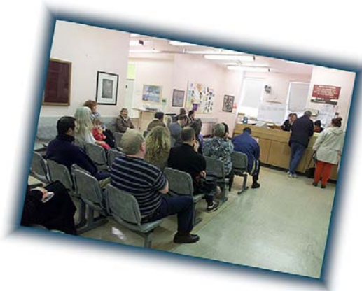
Shaping a more 'efficient and effective' health service

The Case for Change provides an overview of current local services, describes what needs to change and outlines ambitions for the future - for hospital services, primary care and mental health provision.