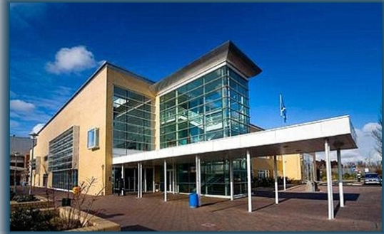
Barts Health will be formally rated by the CQC

The CQC launched a new, 'more intense' inspection regime for hospital trusts in October 2013. Barts Health NHS Trust was one of the first to have an inspection under the new system and listening events were held locally to support this at the end of 2013. The hospital trust was not given a rating following that inspection but will be rated this time.