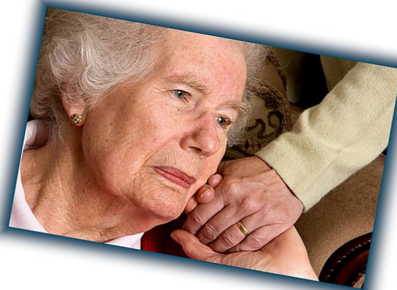
The Care Act is a 'significant piece of legislation'

It also states that Local Authorities must have regard for the individual's views, wishes, feelings and beliefs.