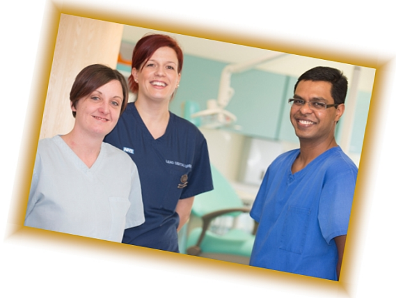
Add your voice to the views of over 1,000 staff

In October 2014 the "Declaration of the Foundations of Community Services" was launched, developed by over 1,000 health and social care staff. The aim of the workshops is to test, validate and spread this work throughout London. ➔ More