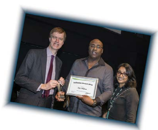
Award winners with local MP Stephen Timms

Staff working in services in Newham secured seven out of the eleven awards, scooping up more awards than any other area of the Trust.