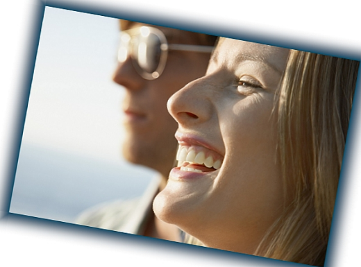
Defining what is important to you

The Macmillan Social Prescribing Service can help you to improve your wellbeing and access services and activities in your local area. The service is available to residents of Tower Hamlets, City & Hackney, Newham and Waltham Forest. It supports you to explore and define what is important for your wellbeing, and identify activities and resources you need.