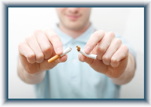
Quitting is easier with support

Seven out of 10 smokers would like to be able to quit. If this sounds like you then why not take advantage of free support in your local area to help you quit for good?