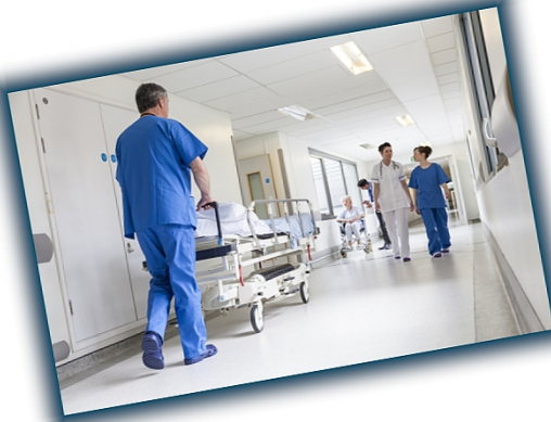
Healthwatch may 'Enter and View' services

This is known as 'Enter and View'. Following visits, we make recommendations based on what we observed and what we were told. We usually visit services that we suspect may be underperforming, but equally, we are interested in services which display good practice.