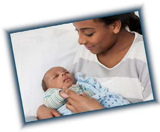
Helping mum and baby get 'best possible care'

Are you pregnant? Do you need a Maternity Mate? Maternity Mates work alongside midwives and health professionals to help the mum and baby receive the best possible care. If you would like to receive the support of Maternity Mates, please discuss this with your midwife or GP, who will refer you. Maternity Mates undergo an accredited training course to Level 3 with the Open College Network (OCN). On-going support is also provided.