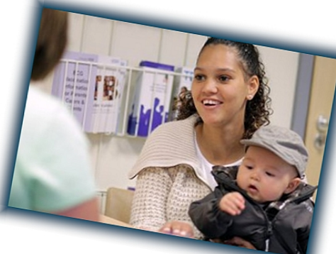
Building 'better outcomes' into services

Newham Clinical Commissioning Group (CCG) has indicated the need to have the Community Health Services (CHS) contract in Newham taken through a procurement process, in line with its commissioning intentions. The procurement of Community Health Services is a major opportunity for the CCG and its partners to deliver the integrated care programme by shifting focus to outcomes based commissioning.