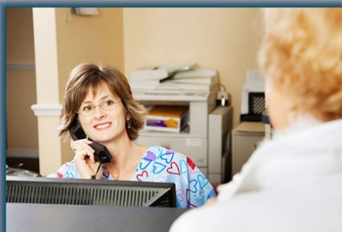
Patients are invited to give their views

This temporary contract is due to end in the summer of 2016 so NHS England and Newham Clinical Commissioning Group (CCG) are required to review the contract and make decisions about its future.