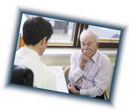
Getting 'good information and advice'

The first tool is the 'Advice and information needs in adult social care' interactive map. The map demonstrates people's typical journeys through the complicated care system and identifies the "pinch points" where councils and other organisations need to improve the information and advice on offer.