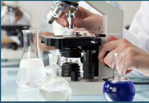
Bringing clinical research expertise to North East London

Barts Health has been chosen as the lead organisation for clinical research across north central and north east London, Essex and Hertfordshire, underlining the Trust's wealth of experience in recruiting patients onto pioneering clinical research trials.